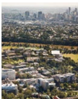
UQ St Lucia

For more testimonials visit www.uq.edu.au/international-students/international-student-testimonials