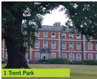
1 Trent Park

Check out how near we are to central London – only 35 minutes by tube.