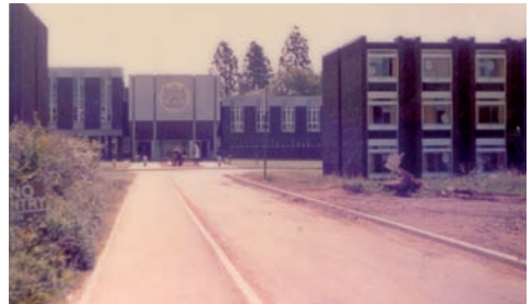
Park Campus Summer 1974

In 2005 The University of Northampton was given full university status and research degree awarding powers.