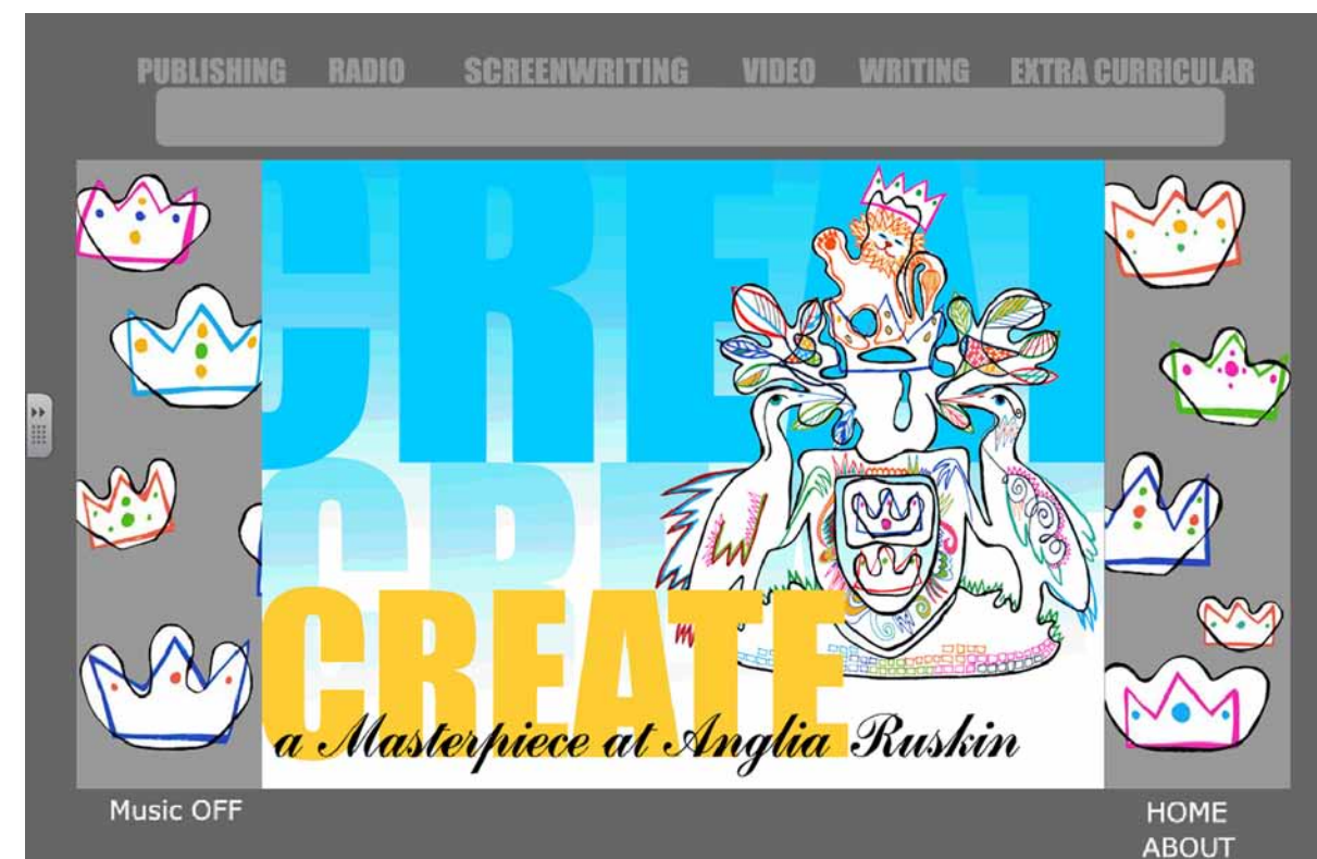
Create an interactive magazine by Year 3 students studying the Creative Publishing module