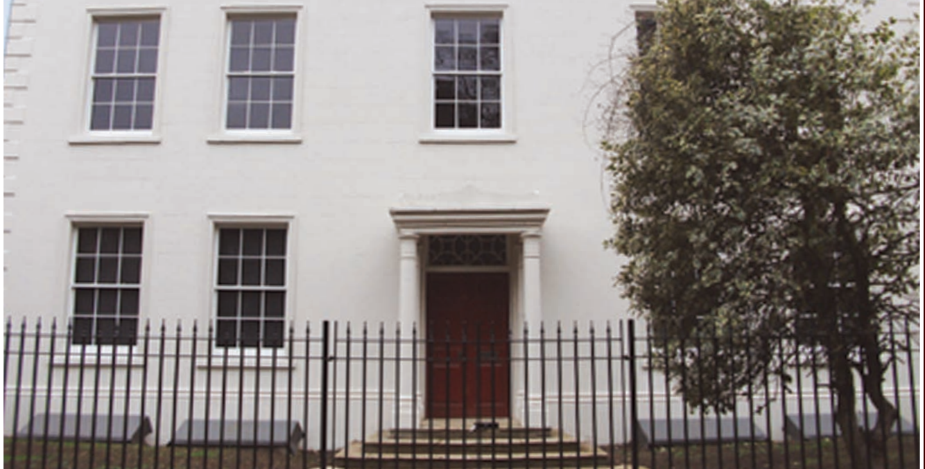
Prebend House (Phase 1 completed in 2010)