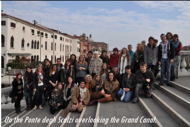
On the Ponte degli Scalzi overlooking the Grand Canal.

This year our first study trip was to the Venice. The main reason for this trip was to see the Venice Biennale . We organise a visit every two years to coincide with this amazing survey of contemporary art — next visit 2013! The real highlight was Thomas Hirschhorn's incredible installation in the Swiss Pavilion featuring mirror crystals and parcel tape as well as