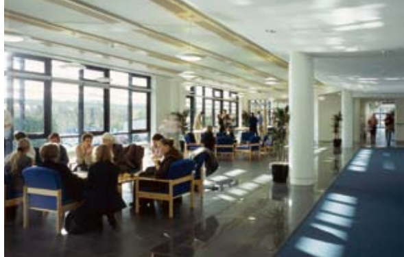
Peninsula Postgraduate Health Institute

The university has a number of nodes around the world, which facilitate the distance study for a PhD in certain disciplines. Nodes currently exist in Zurich, Milan and Darmstadt. New ones are proposed for Beijing, Sao Paulo and at Greenwich in London.