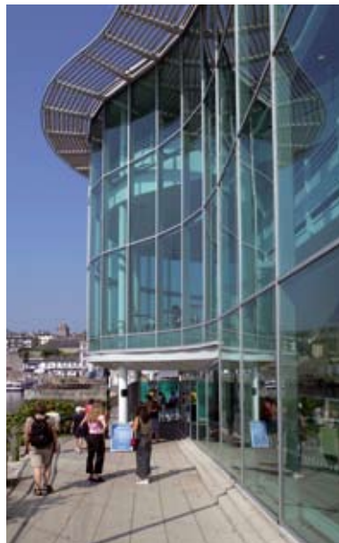
The National Marine Aquarium

The newly built fitness complex on the campus offers state-of-the-art resistance and cardiovascular fitness equipment. There are also squash courts available and a wide range of instructor led fitness classes including circuit training, aerobics, body combat, body conditioning, t'ai chi and yoga.