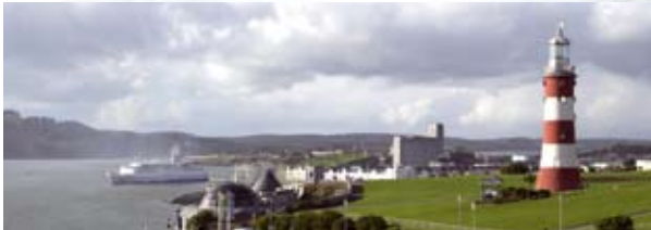
Smeaton's Tower on the Hoe

Among the usual high street shops and fashion boutiques, Plymouth city centre boasts Drake Circus, a new multi-million pound indoor shopping complex. In addition there are some quirky boutiques and antique parades in the historic Barbican area of the city.