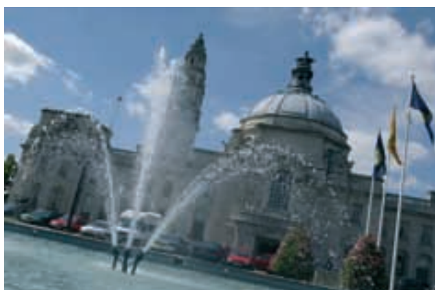
Cardiff's Civic Centre, home to the University

Cardiff benefits from excellent road and rail links with Britain's other major towns and cities. London, for example, is two hours by train, and the M4 links both the west and south of England, as well as west Wales. Travel to the Midlands and the North is equally convenient. The journey by road from Birmingham, for example, takes only two hours. The main coach and railway stations are both centrally placed and Cardiff also has an international airport.