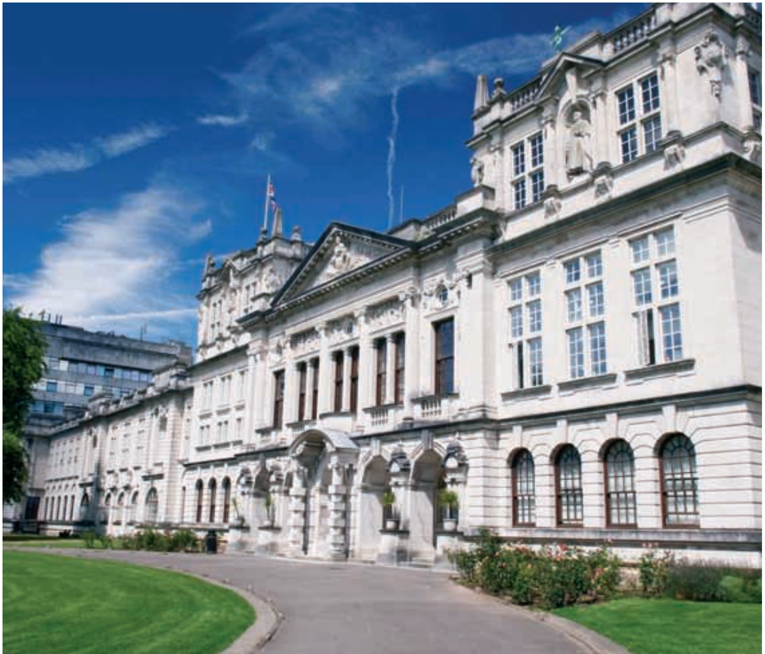
The University's Main Building

The University has an outstanding location among the parks, Portland stone buildings and tree-lined avenues that form the city's elegant civic centre. Unusually for a civic university, most of the University's student residential accommodation is within easy walking distance of lecture theatres, libraries and the Students' Union, saving you time and money. More than £200 million has been invested in the university estate in recent years to provide new and refurbished facilities of the highest quality.