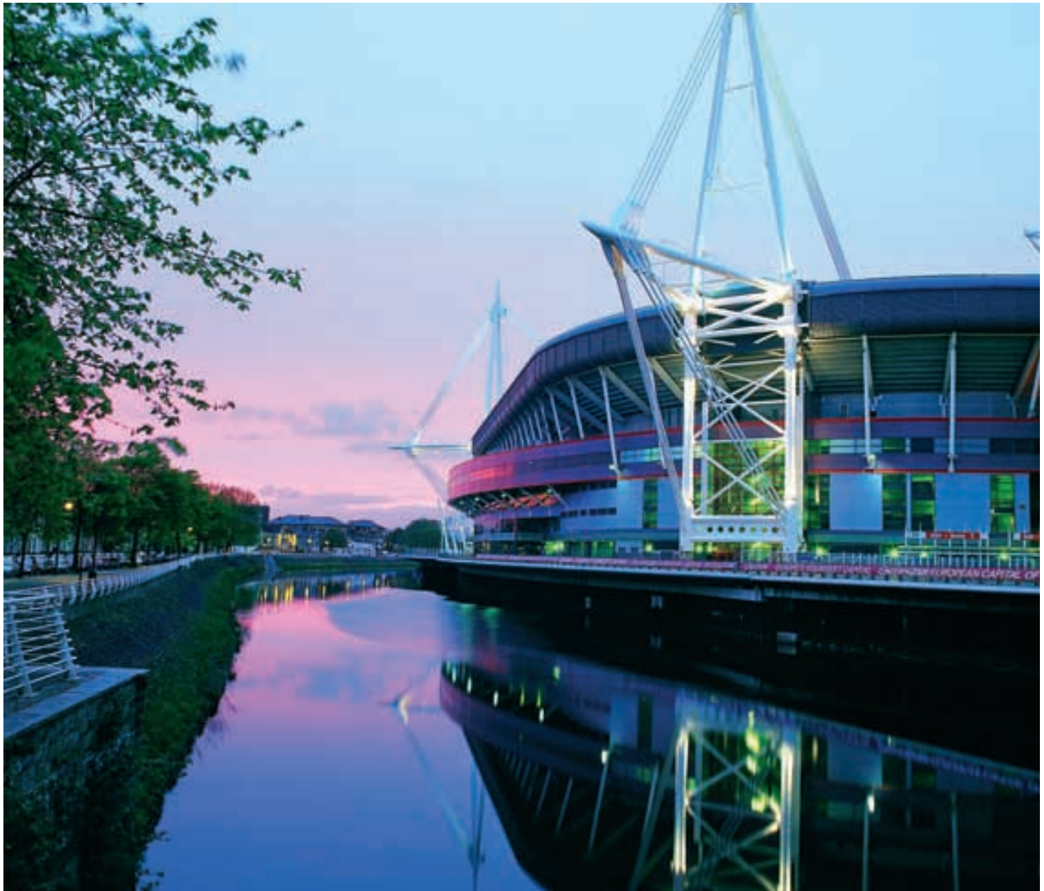
The Millennium Stadium

Culturally, Cardiff is well catered for with, the National Museum and Gallery of Wales, several theatres covering a wide range of tastes and the historic Cardiff Castle. The city also boasts a vibrant shopping centre, numerous cinemas and restaurants, great pubs and music venues. The development of Cardiff Bay is a major attraction and is home to the Welsh Assembly and the impressive Wales Millennium Centre.