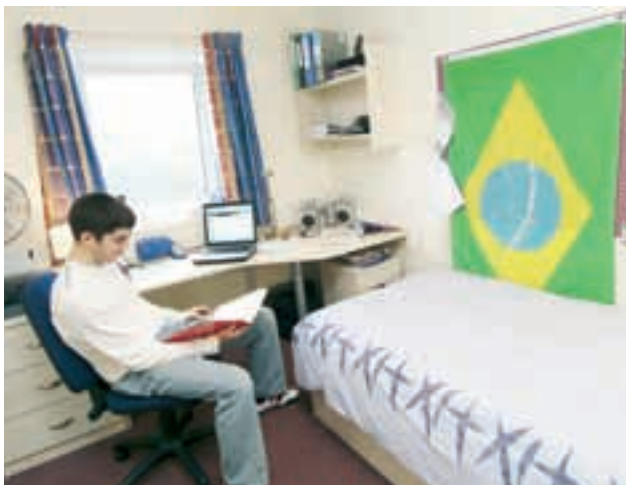
A typical study bedroom