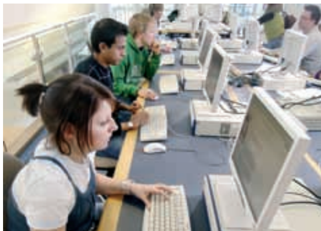
Students have access to the latest IT facilities