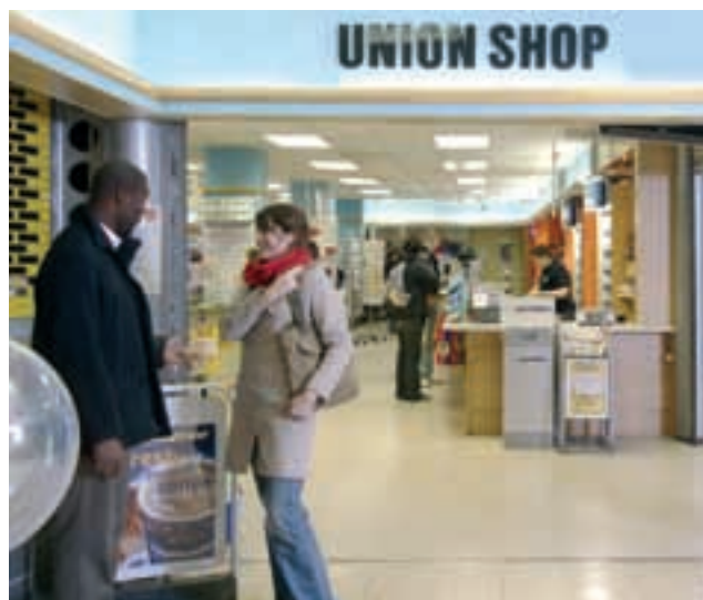
The Union shop, part of the purpose-built Union complex

"Cardiff Students' Union is the biggest and best equipped in Britain."