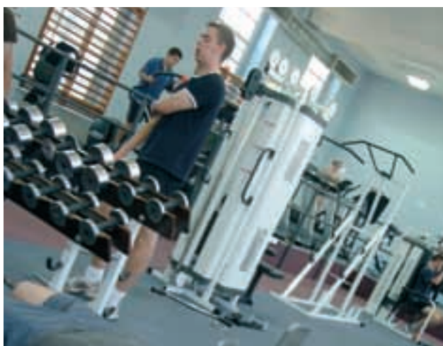
The University has three sports centres