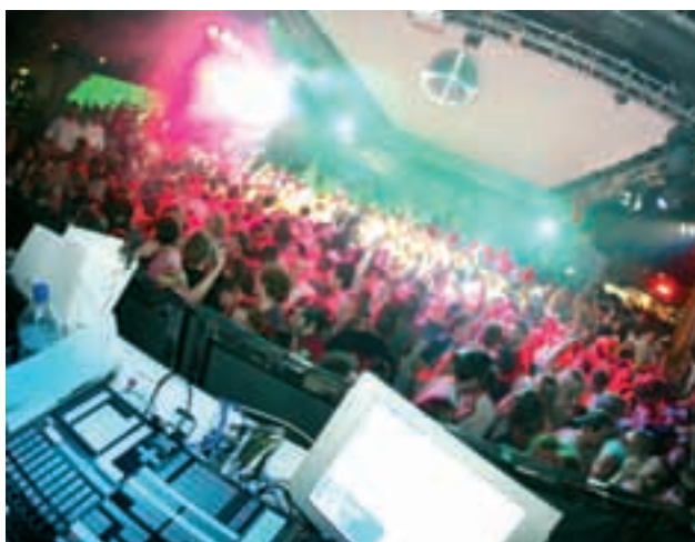
Solus nightclub, the Union's state-of-the-art nightclub

The Jobshop is a student employment service that provides casual, clerical and catering jobs around the University to hundreds of students for up to 15 hours a week.