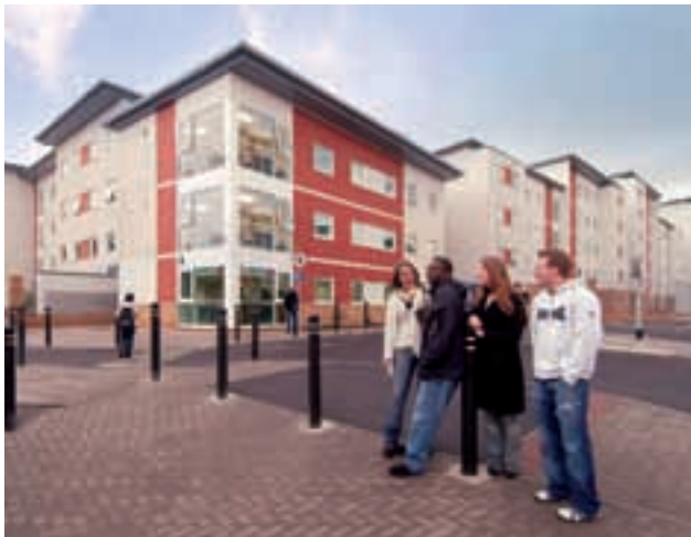
Talybont Court, the University's newest residence