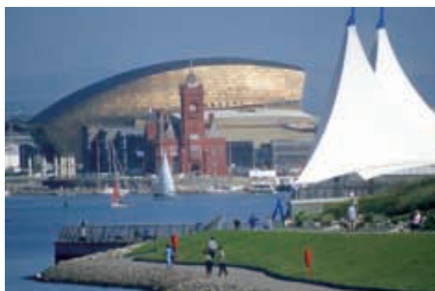
Cardiff Bay, the city's waterfront