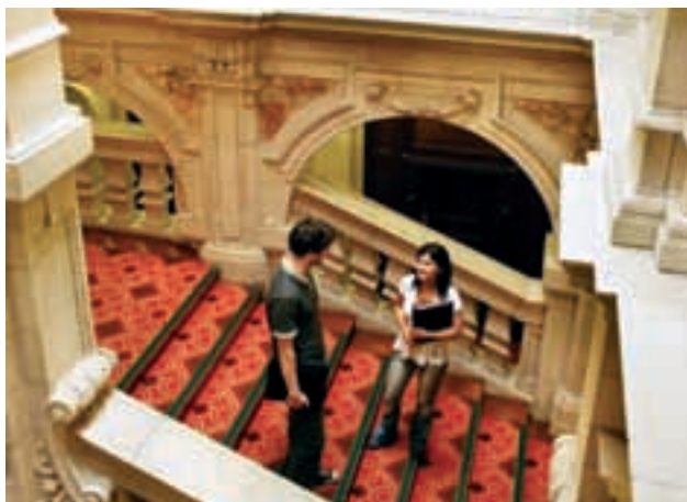
Cardiff has a relaxed and friendly atmosphere