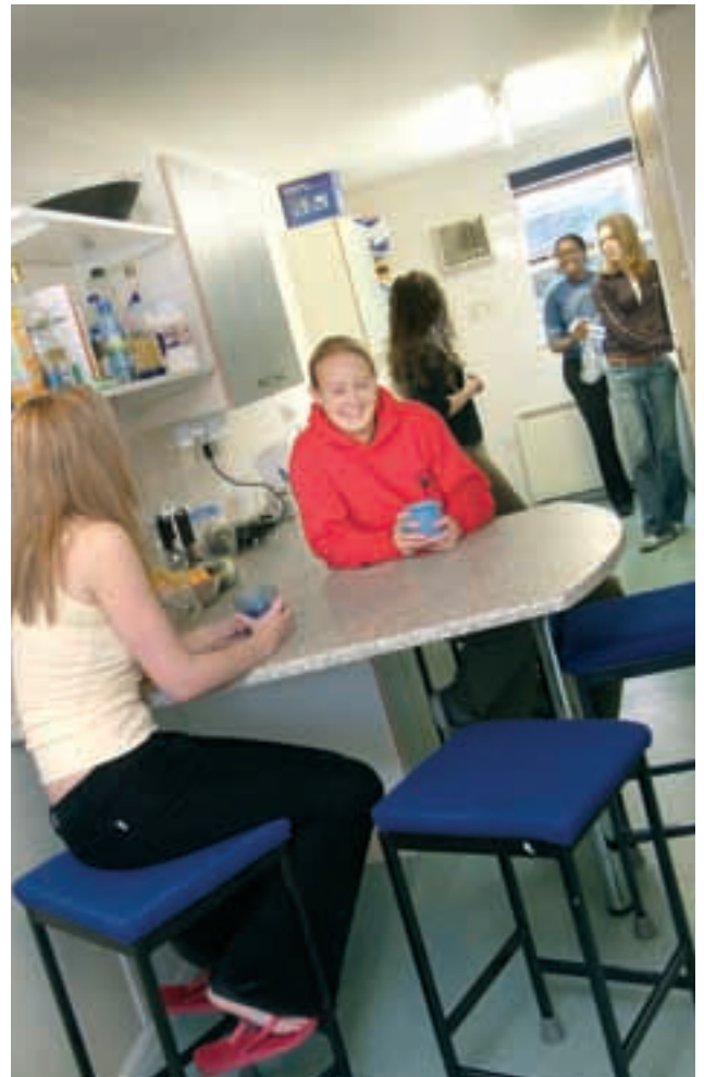
There is a range of catered and self-catered accommodation available