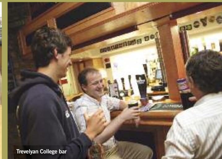
Trevelyan College bar