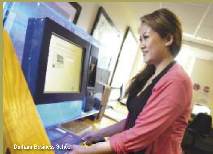
Durham Business School