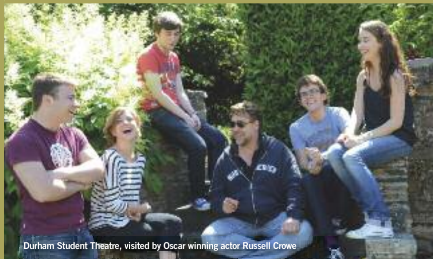
Durham Student Theatre, visited by Oscar winning actor Russell Crowe