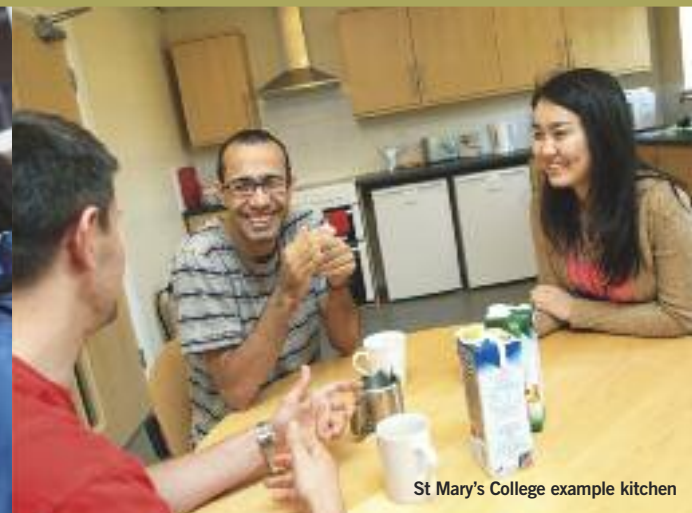
St Mary's College example kitchen