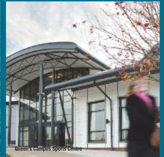
Queen's Campus Sports Centre