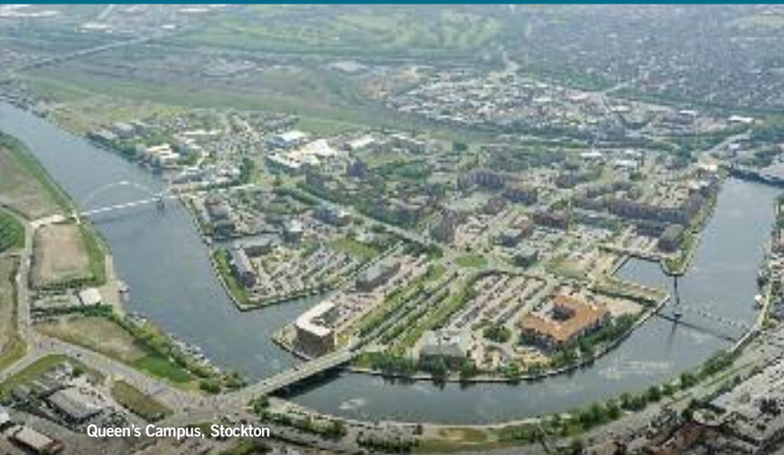
Queen's Campus, Stockton