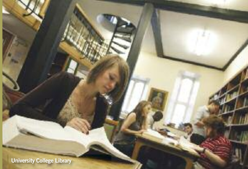
University College Library