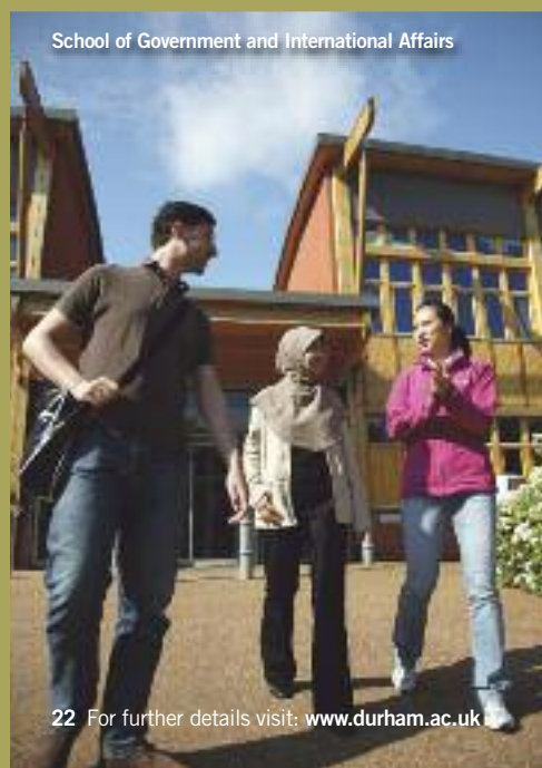
School of Government and International Affairs