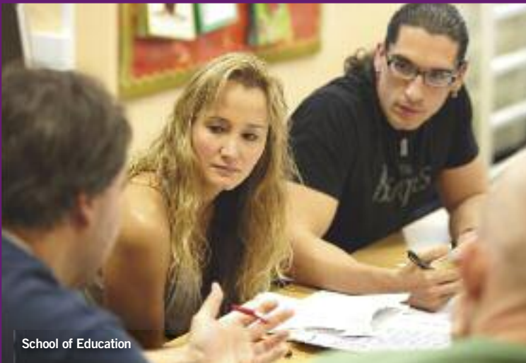
School of Education