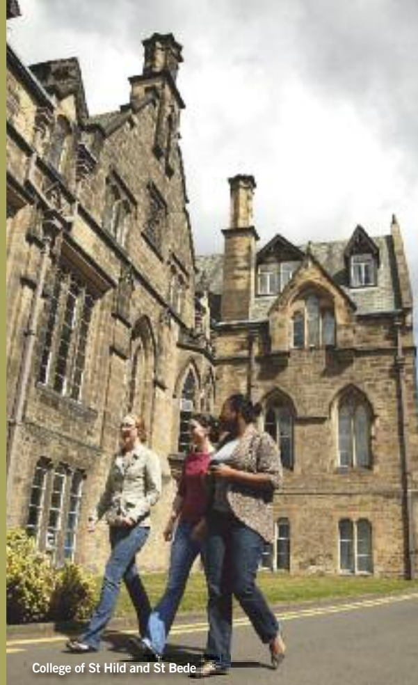
College of St Hild and St Bede