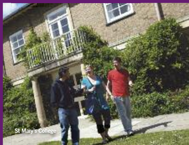
St Mary's College