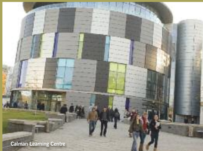
Calman Learning Centre