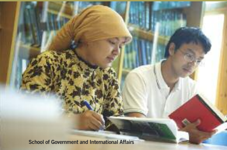
School of Government and International Affairs