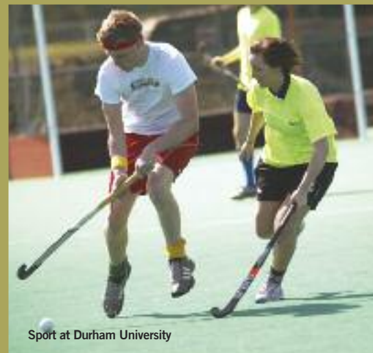
Sport at Durham University