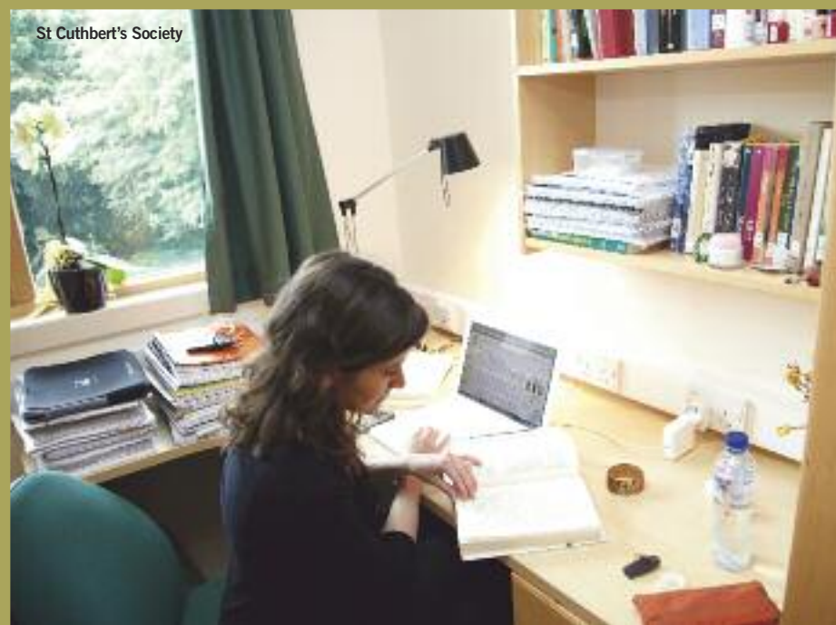
St Cuthbert's Society

£10m invested in postgraduate student support in 2011/12.