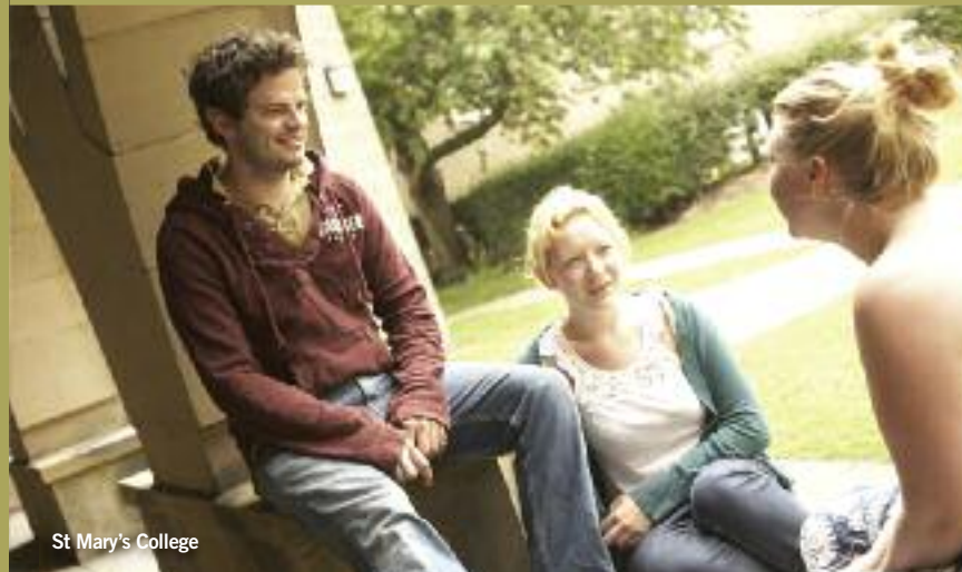
St Mary's College