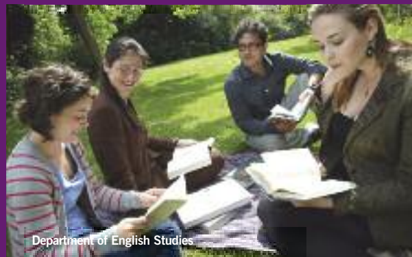
Department of English Studies