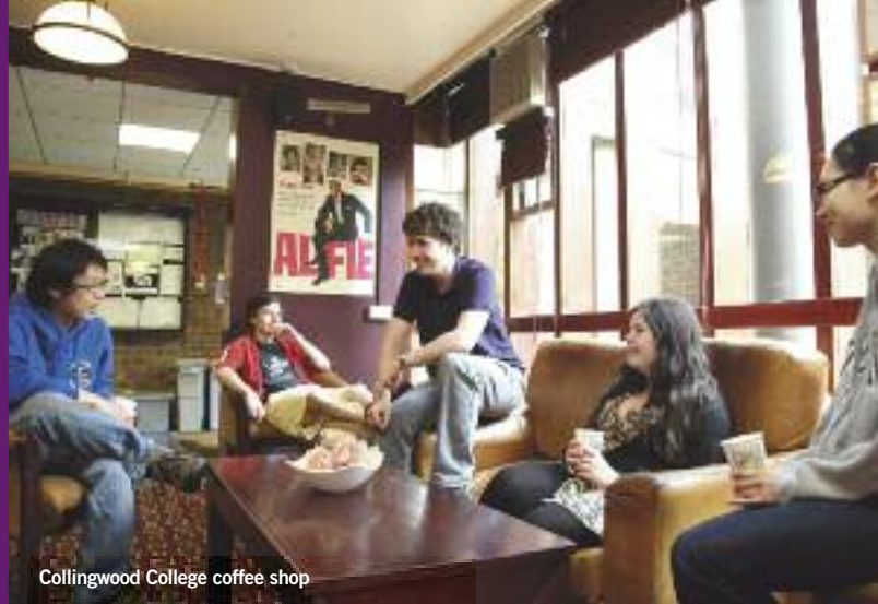
Collingwood College coffee shop