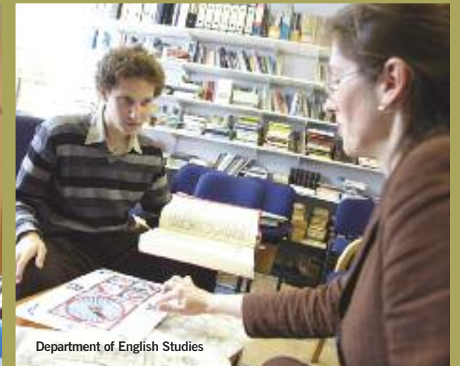
Department of English Studies