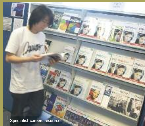
Specialist careers resources