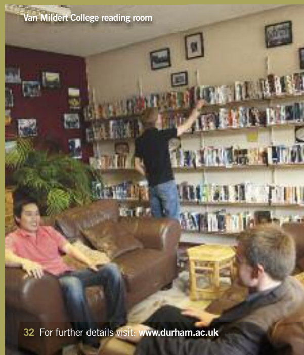
Van Mildert College reading room