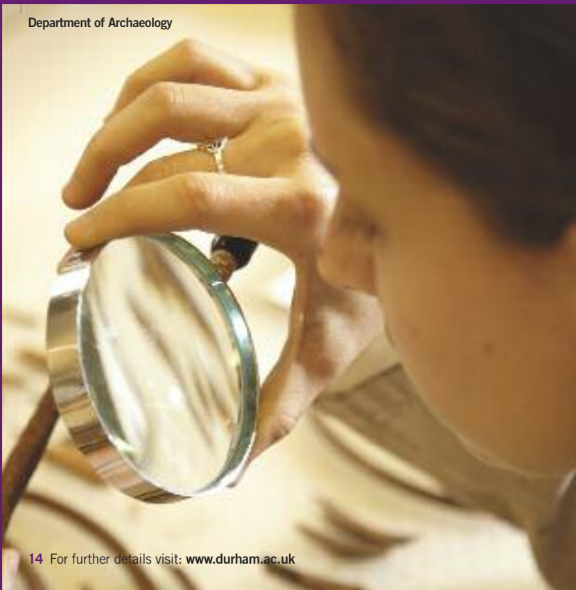
Department of Archaeology