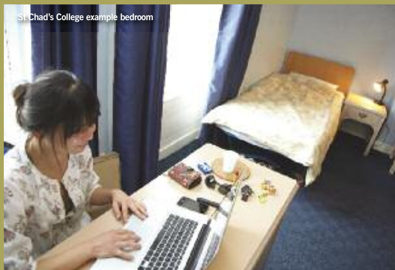
St Chad's College example bedroom