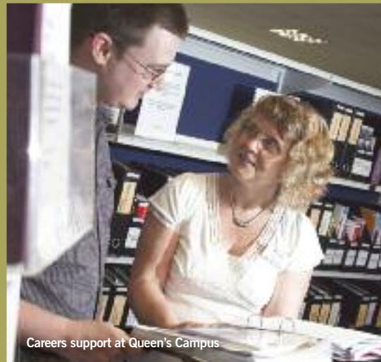
Careers support at Queen's Campus