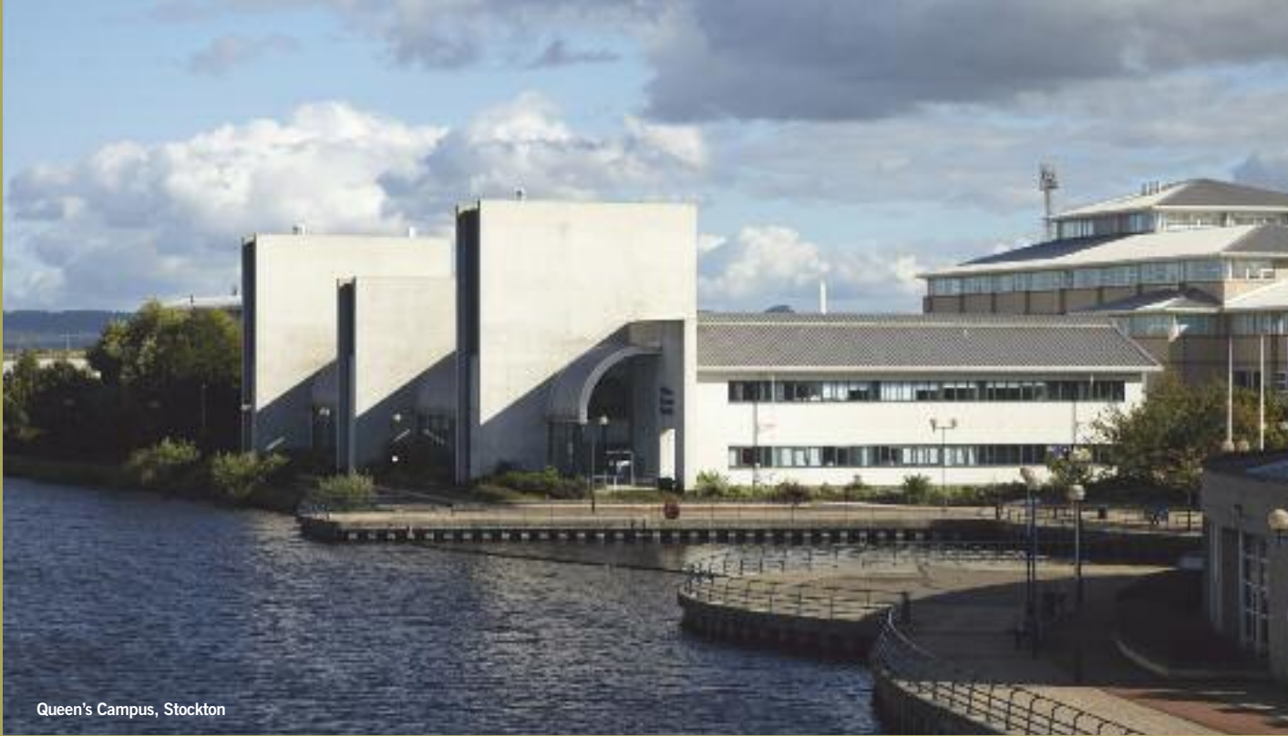
Queen's Campus, Stockton