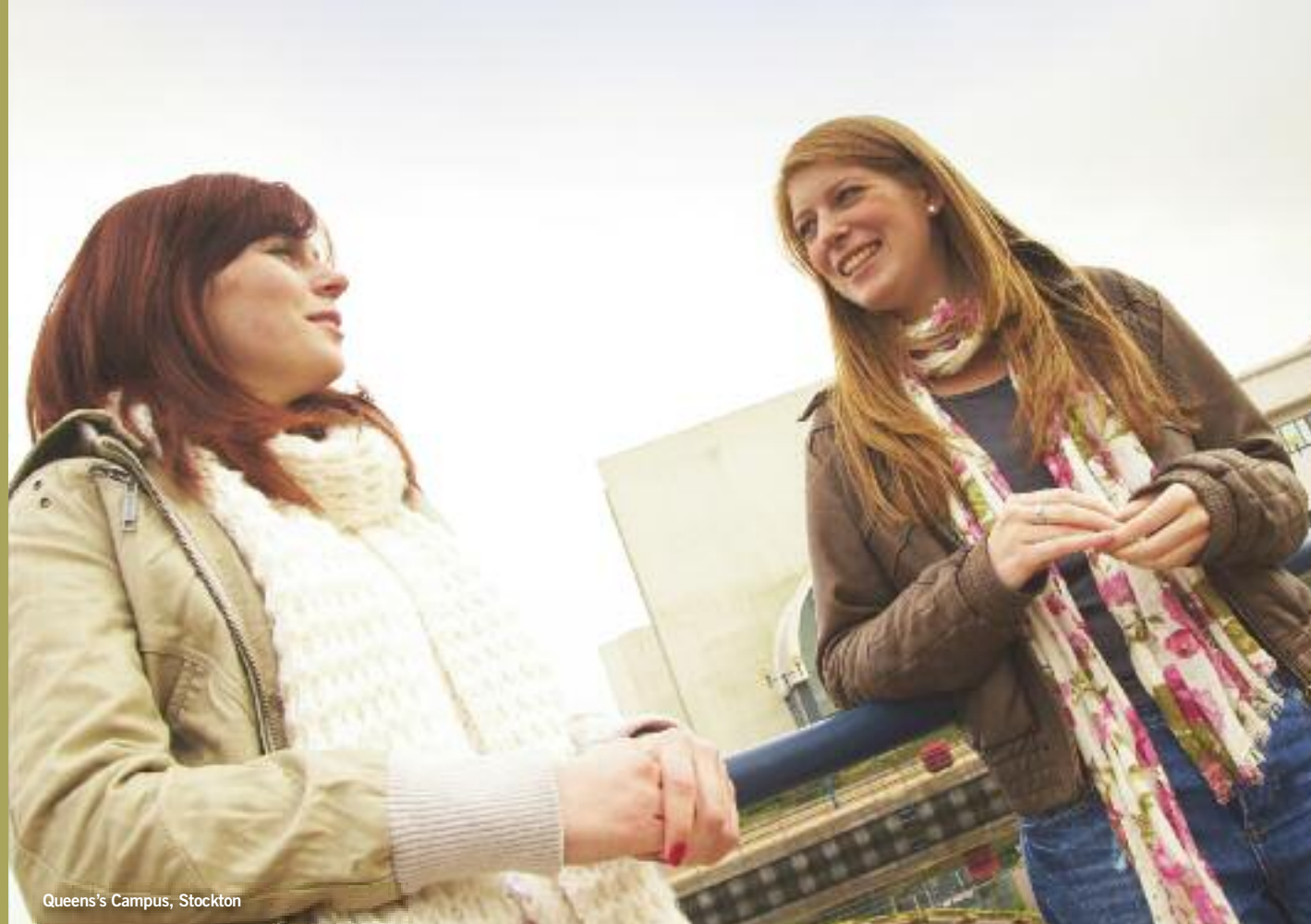
Queens's Campus, Stockton