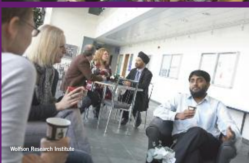
Wolfson Research Institute