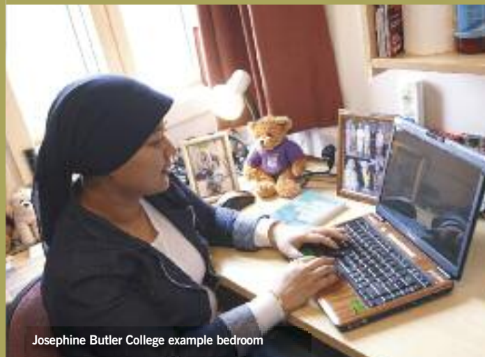
Josephine Butler College example bedroom