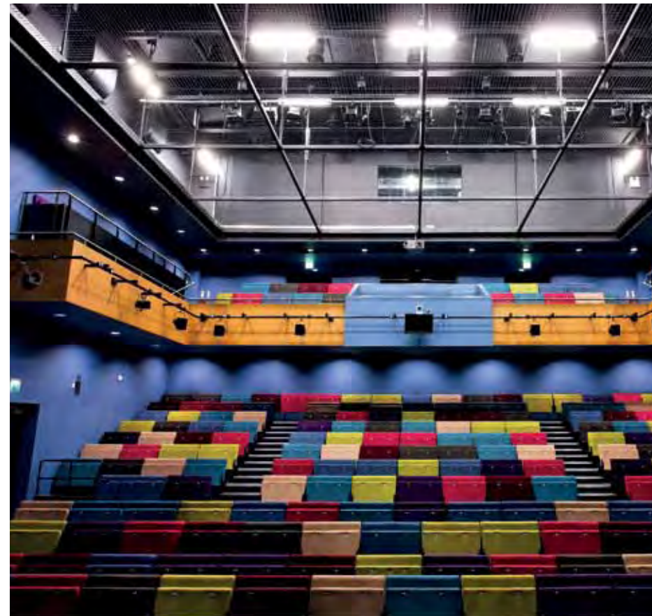
Inside the Lincoln Performing Arts Centre, Brayford Pool campus. 21

The space boasts a 446-seat theatre, three large studio spaces for performance and rehearsal, backstage facilities and workshops. The Centre regularly holds high-profile live performances, including a broad variety of plays, comedies and musical concerts. Past performances have included the National English Contemporary Ballet, Nicola Benedetti, Chris Addison, We're going on a Bear Hunt , The Caretaker , BBC Radio 4's Just a Minute and Ian McMillan. Each performance is open to all students and the wider community to attend, firmly positioning LPAC as one of the city's top arts centres.