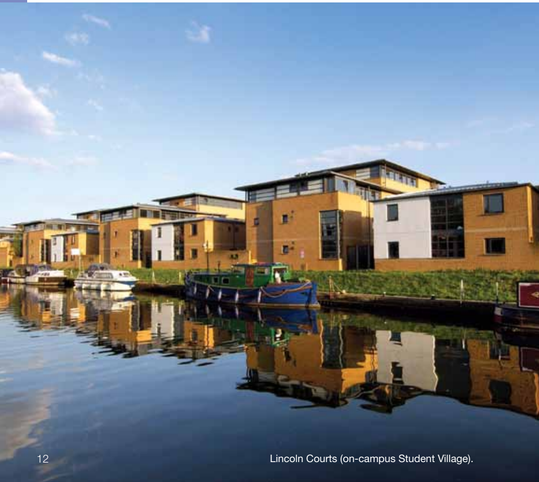
Lincoln Courts (on-campus Student Village).