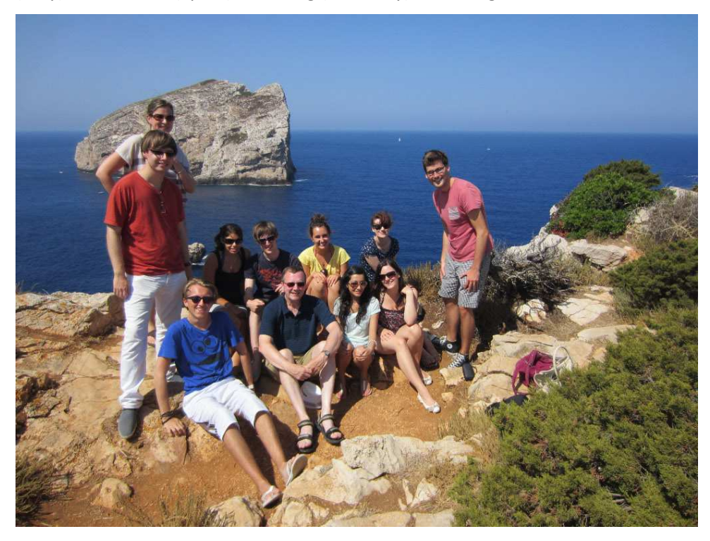
Staff and students enjoying the Calgari sunshine

Ten undergraduate students and four members of staff took part in the first ERAMUS Intensive programme- funded summer school in Sardinia, Italy in July. This involved a collaboration between Cagliari (Italy); Juan Carlos (Spain); Marburg (Germany) and Glasgow.