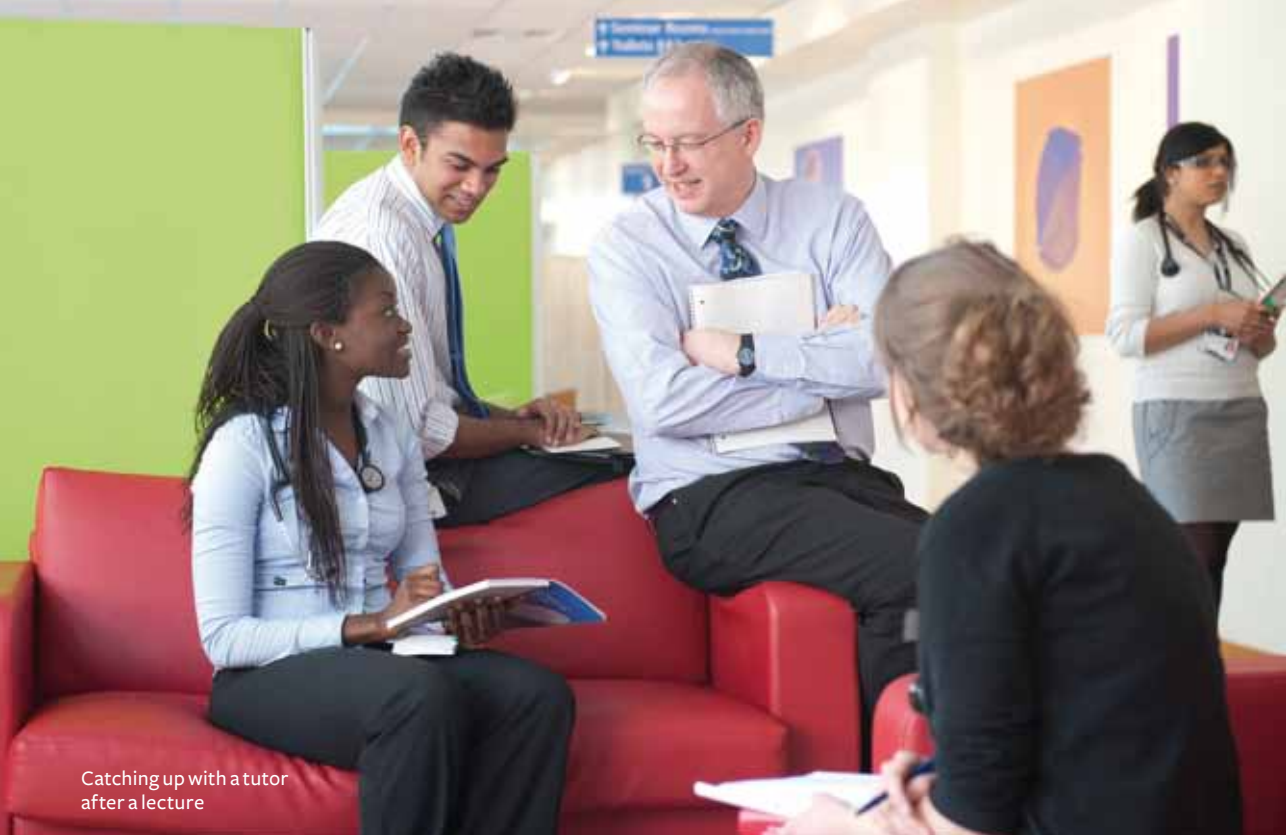
Catching up with a tutor after a lecture

We have a special responsibility to ensure that all students admitted to the BM programmes will be eligible for registration by the General Medical Council upon graduation. It is important to us that our students are able to fulfil the rigorous demands of professional fitness to practice.