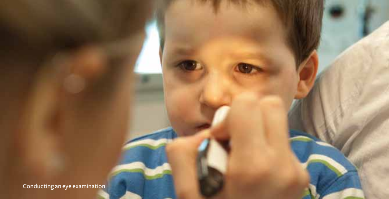
Conducting an eye examination