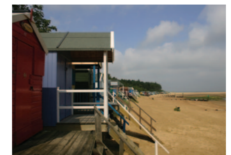
We have lovely surrounding areas such as the North Norfolk coast.

Norwich is such a wonderful city with everything you could possibly want! It has a great nightlife, fantastic gigs and arts events and the shopping is great with lovely surrounding areas such as the coast at Sheringham, North Norfolk.