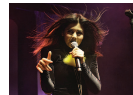
The LCR is a great venue, really intimate, I have recently been to see Ellie Goulding and Marina And The Diamonds.

I hope to qualify as a midwife in the summer of 2013 and – fingers crossed – get a job at the Norfolk and Norwich University Hospital. I hope to then go travelling and practise as a midwife in other parts of the world.