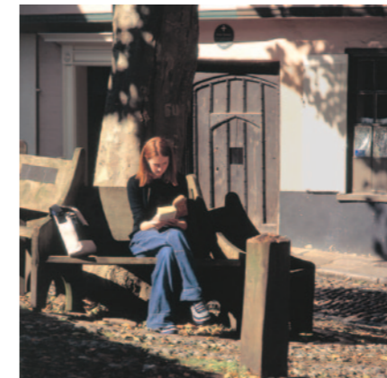
Norwich is England's first UNESCO City of Literature.

Stephen Fry, actor, writer and UEA Honorary Graduate