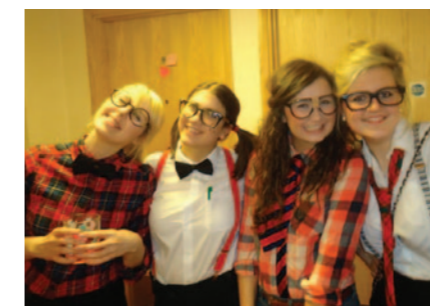
Tuesday night in the UEA LCR is fancy dress night!

My advice would be to enjoy it, and have great fun!