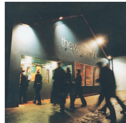
The Waterfront is UEA's very own live music venue and nightclub situated in Norwich's city centre.

“I think Norfolk is the most beautiful and perfect place on Earth.”