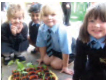
After school care is available to allow working parents the opportunity to collect children at later times.

Pupils using our extensive transport network can also do their homework at school while awaiting the departure of their school bus.