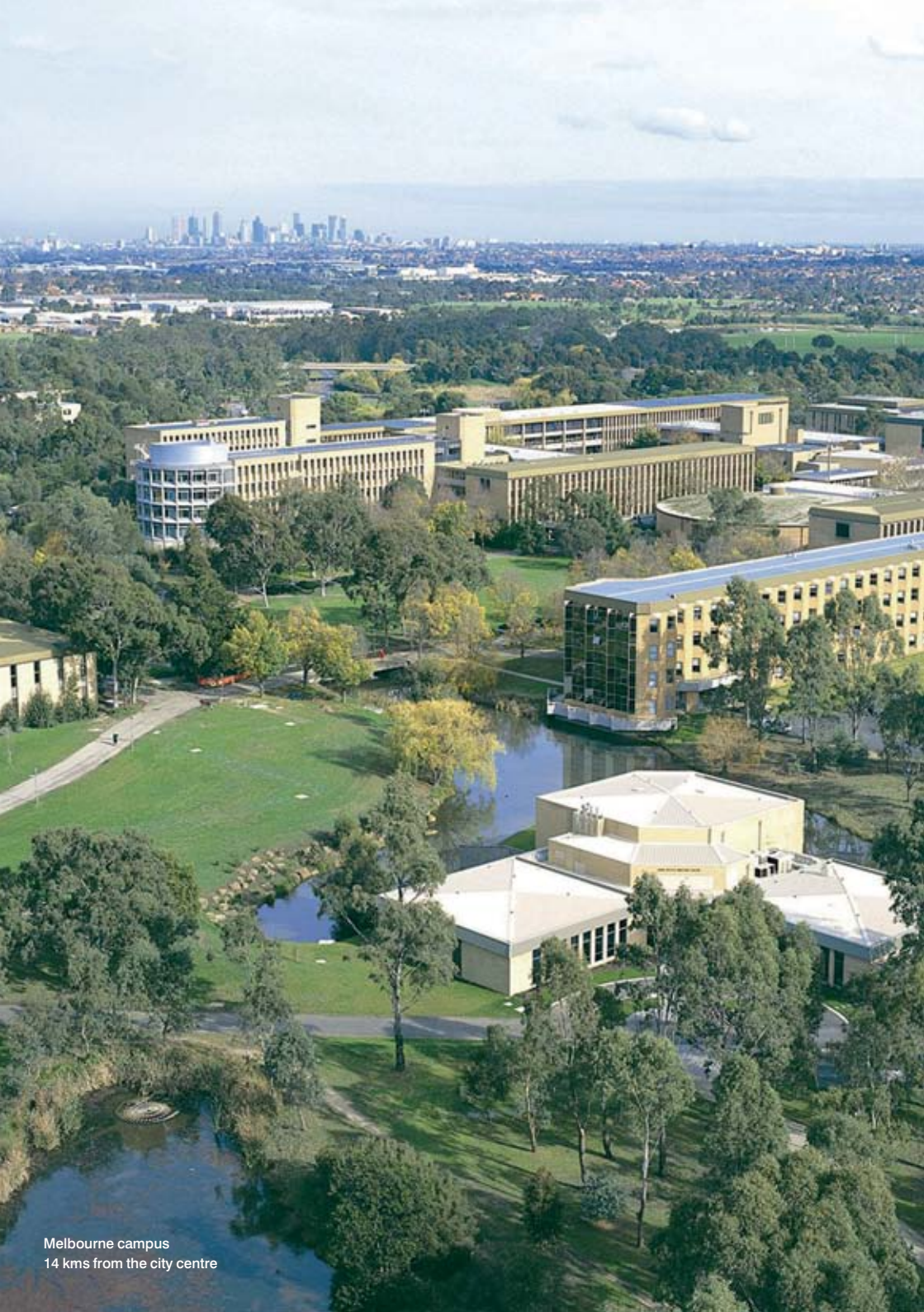
Melbourne campus 14 kms from the city centre