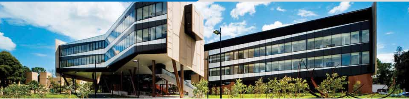
Campbelltown Campus, University of Western Sydney