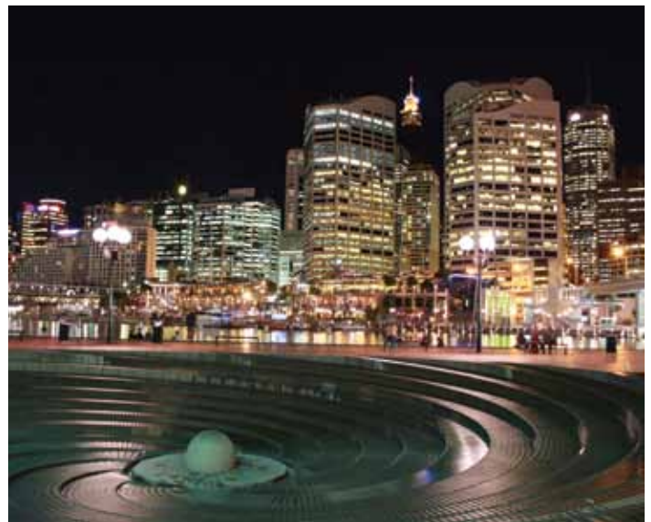
Darling Harbour, Sydney

The UWSCollege campuses are a 30-60 minutes train trip to Sydney's central business district. You will find plenty to enjoy in this cosmopolitan city: shopping, sightseeing,