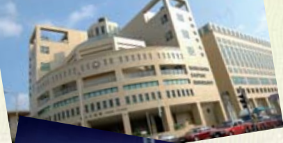
Hong Kong Baptist University, Hong Kong