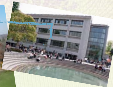
Kyoto Sangyo University, Japan