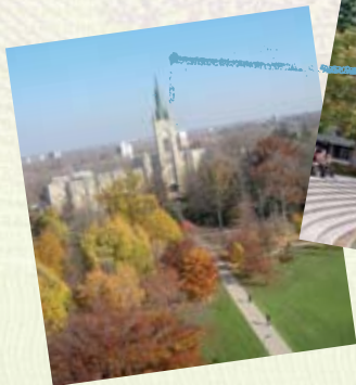
University of Western Ontario, Canada