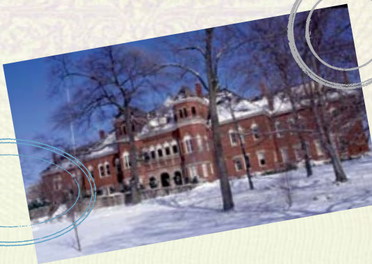
University of North Carolina at Greensboro, USA

As a postgraduate you need to have completed at least the equivalent of one full-time semester before you can go, however you can apply at the start of your ECU course.