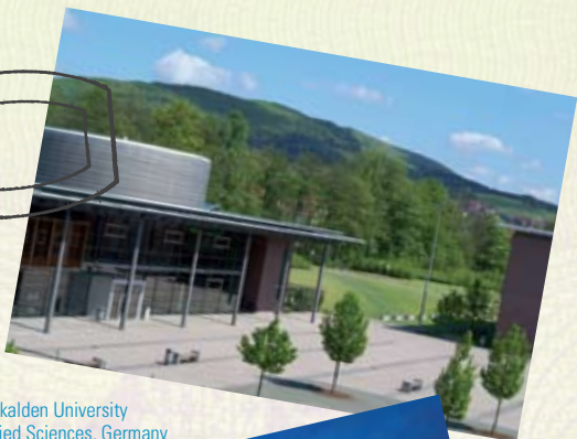
Schmalkalden University of Applied Sciences, Germany