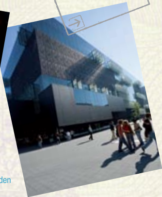
Jönköping University, Sweden