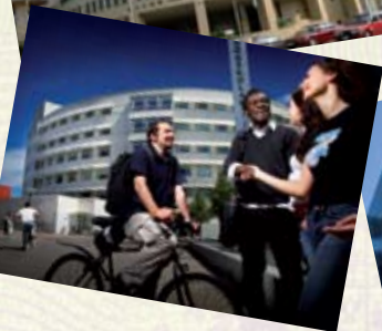
Utrecht University, the Netherlands