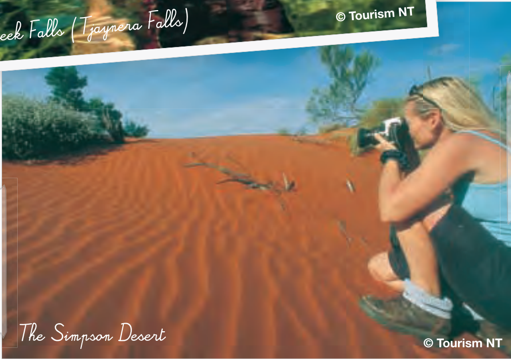
The Simpson Desert