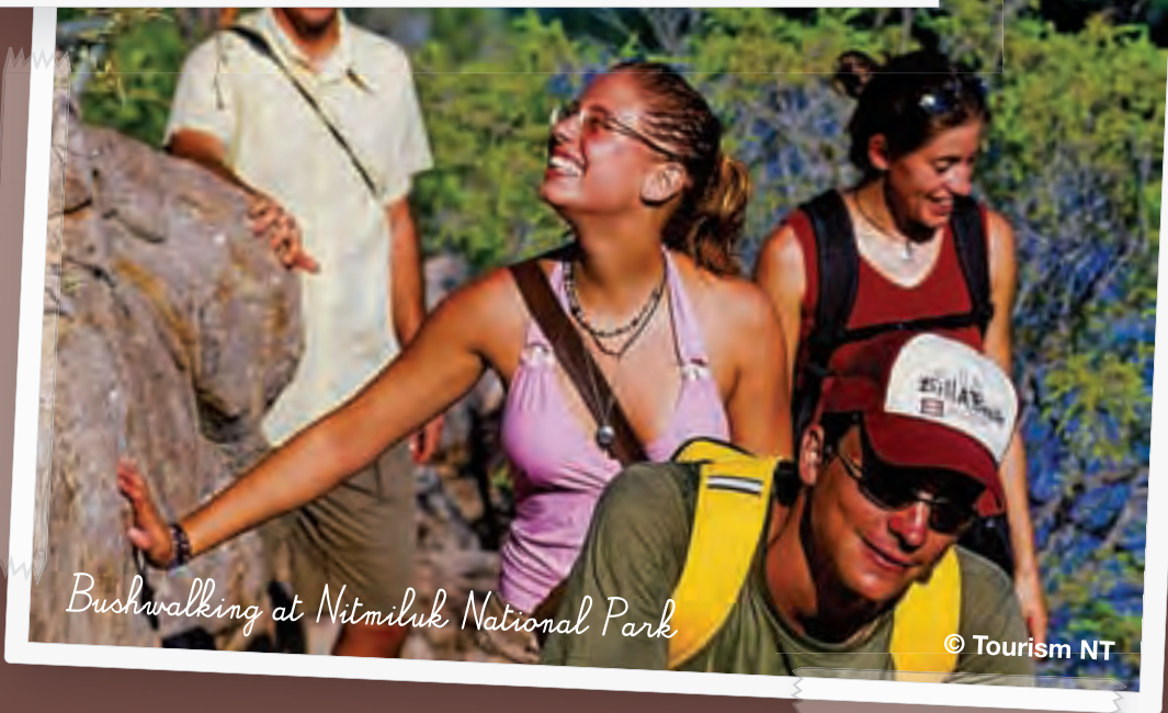
Bushwalking at Nitmiluk National Park