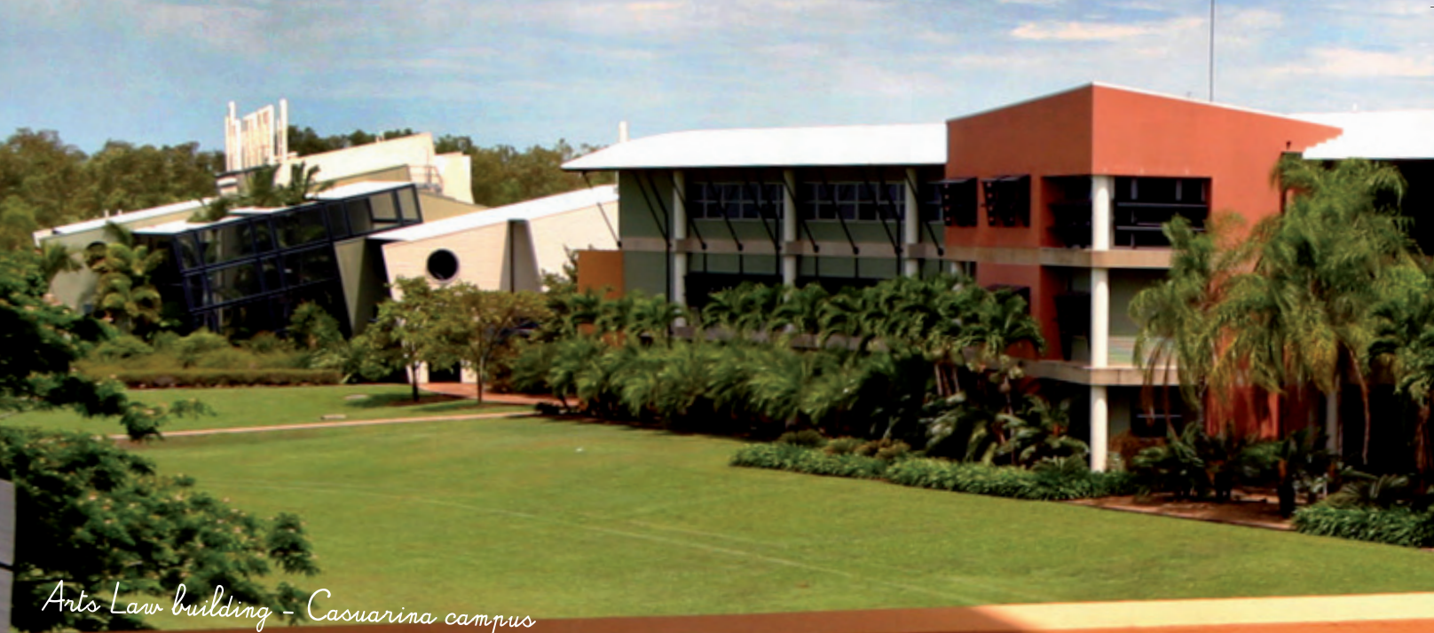
Arts Law building - Casuarina campus