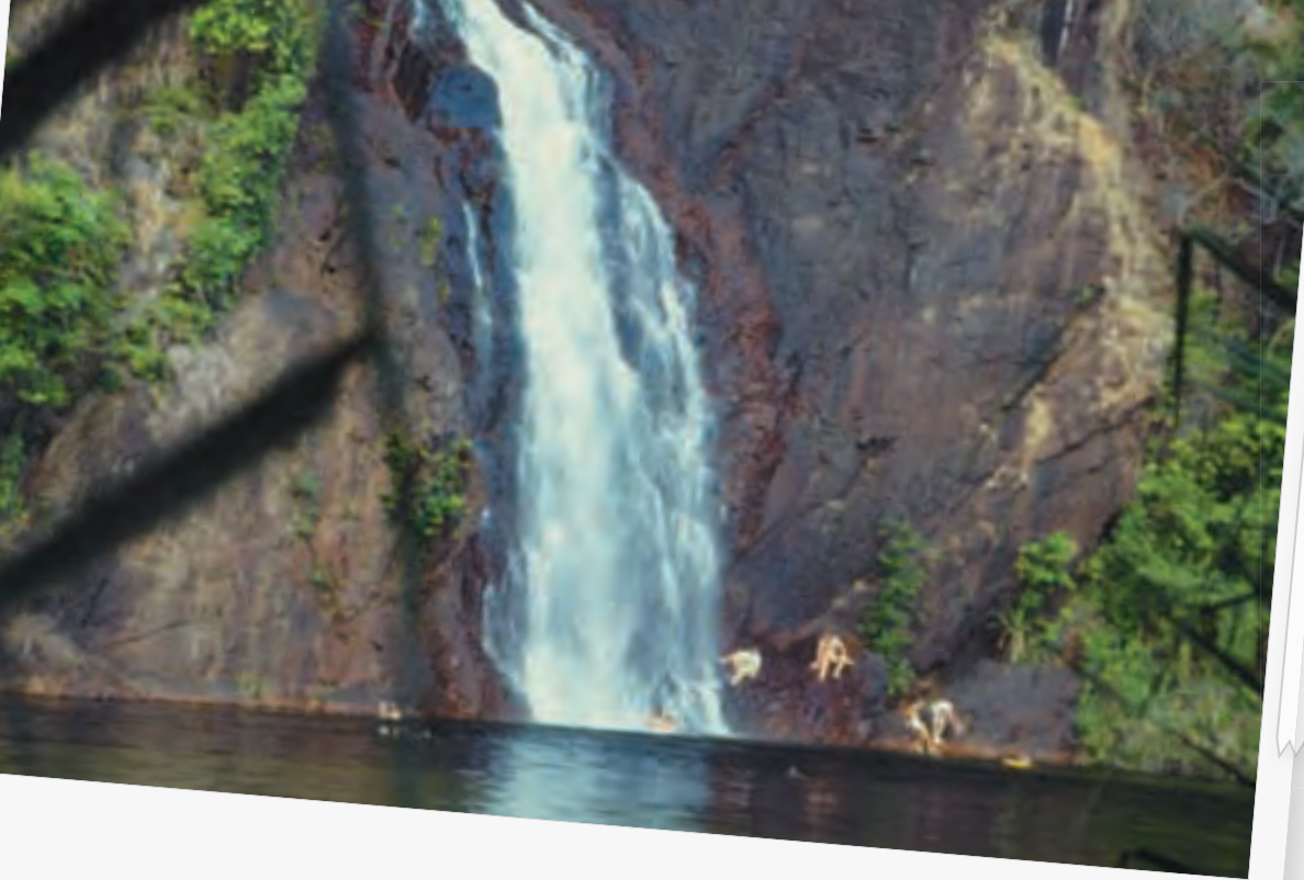
Litchfield National Park