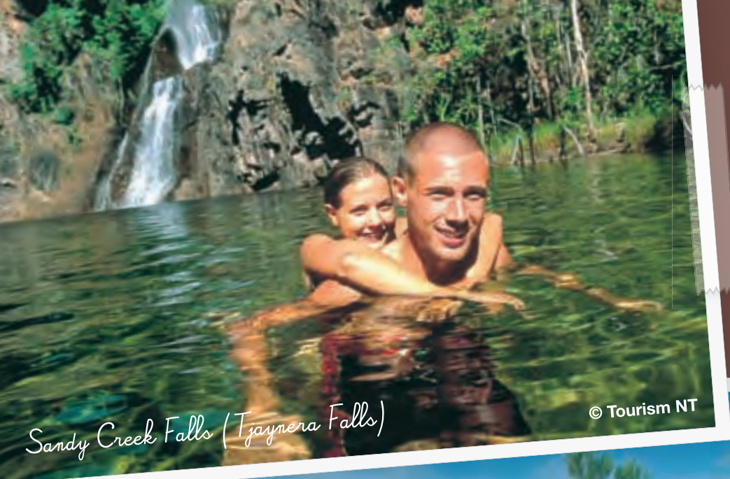
Sandy Creek Falls (Tjaynera Falls)