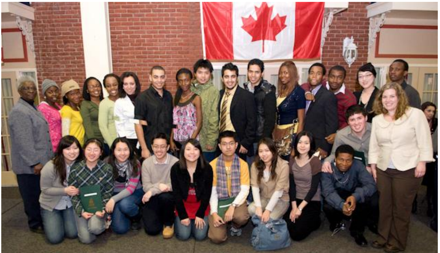
UPEI International Development Week Luncheon, February 2009