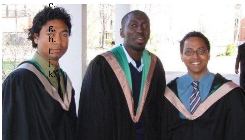
UPEI International Graduates, May 2009

Citizenship and Immigration — Work Permit CPC-Vegreville 6212 - 55th Avenue, Unit 202 Vegreville, AB T9C 1X6 CANADA