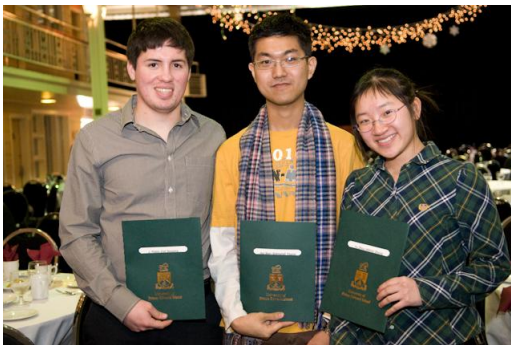
International Development Week, Feb. 2009

Depending on your program, some of your first-year lectures may consist of a fairly large number of students, although at UPEI an effort is made to keep the classes small. You will be given a course outline with a description of the course, your reading requirements, and the methods of evaluation. In general, the grades for the courses will be based on assignments (research papers, presentations, or group projects), as well as tests, mid-terms, and final exams. The weighting of the grades is usually determined by the professor and/or department.