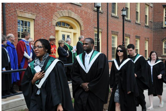
Convocation, May 2009

From reading the preceding pages of this Student Guide, you can see that there are many ways to make the most of your student experience by involving yourself in the UPEI community and beyond. Once again, we understand that overcoming culture shock will not be easy. It is important to establish simple goals for yourself. We would encourage you to keep a journal in which you are able to reflect upon your progress.