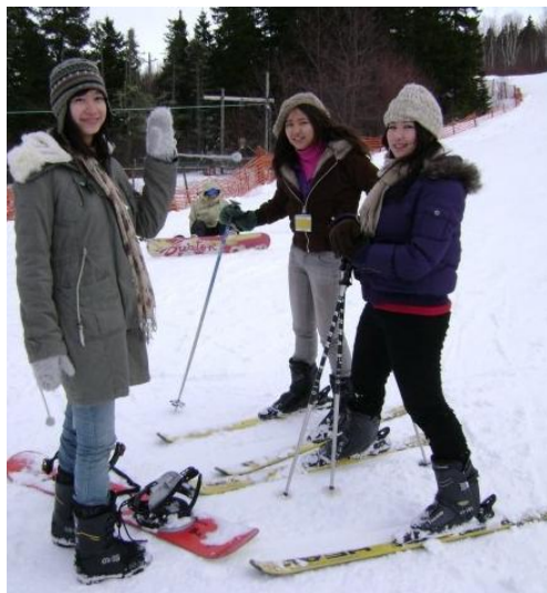
Ski trip, January 2009

Typically, some social events are organized during the academic year for international students to mingle among themselves and among the larger community. Your participation in social events is valuable for you and for everyone because it provides you with a break from the pressures of academic life and allows for building new friendships. It is most important that the ISAs and the SIS executive have your contact information, as social events are usually advertised by e-mail and/or on social networking sites. Make sure you are informed of what is going on!