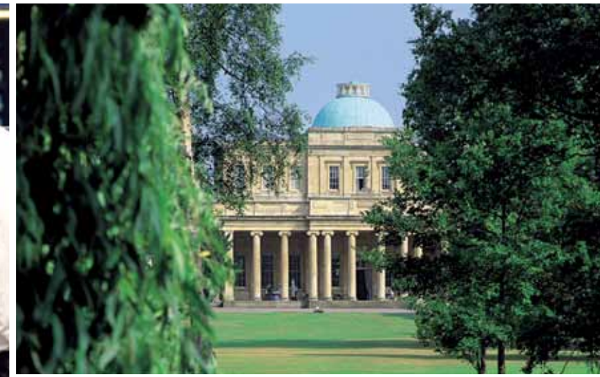
If you would like to find out more then come and visit us during an Open Day (see www.glos.ac.uk/open for details) or alternatively contact us using the details on page 8.