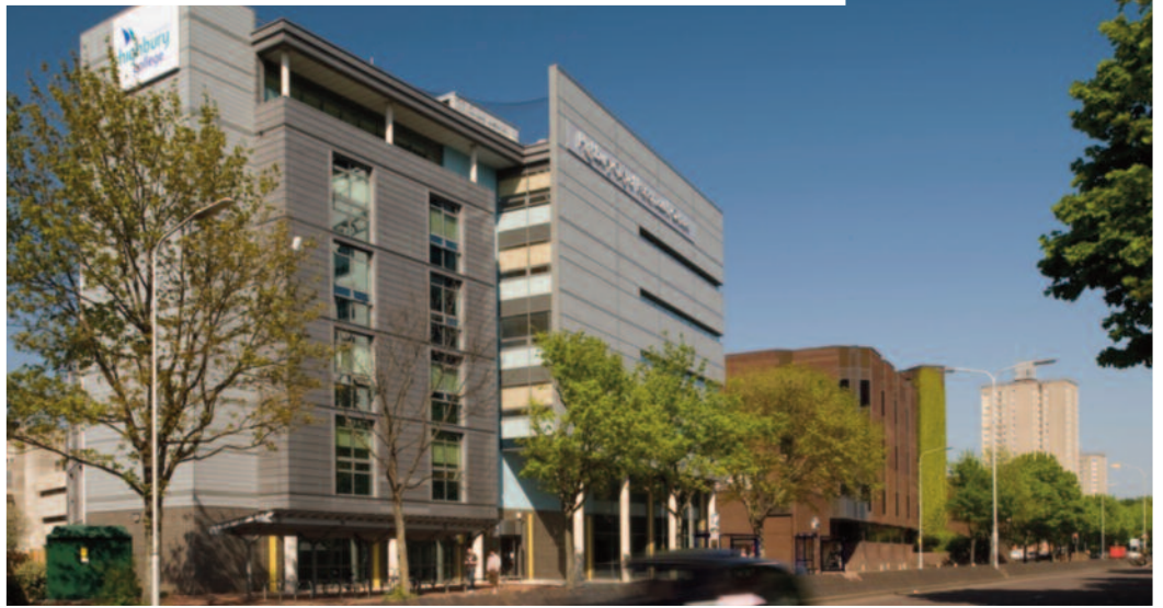
Highbury City of Portsmouth Centre