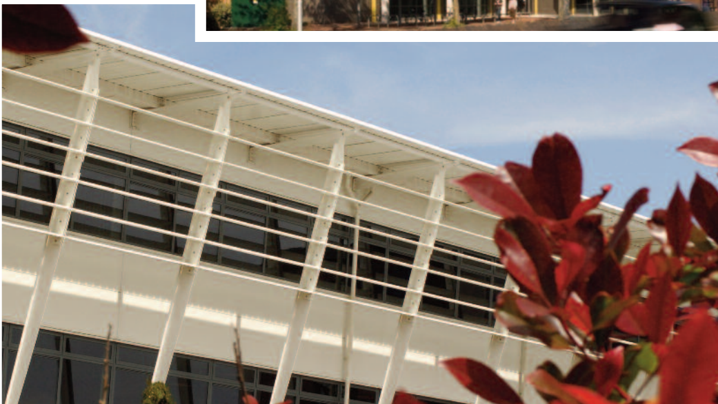
Highbury Northharbour Centre