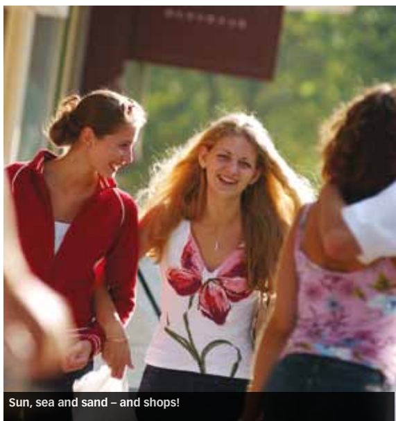
Sun, sea and sand – and shops!

Portsmouth is also on the doorstep of the South Downs National Park, which has a beautiful landscape, diverse wildlife and a fascinating cultural heritage. Nearby is England’s Jurassic Coast, 150km (95 miles) of wild beaches, sheer cliffs and stunning rock formations. This UNESCO World Heritage site is famous for its geology and fossil finds.