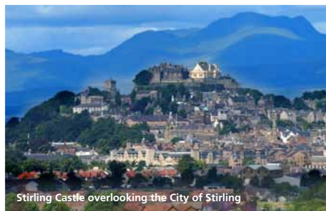
Stirling Castle overlooking the City of Stirling

The city's a major tourist destination, something reflected in the wide choice of cuisine at the numerous restaurants, bistros and cafés. There's everything from pub grub to fine dining, with Italian, Indian, Chinese, Thai and Mexican all well represented. And you can pop into nearby Bridge of Allan for delis, bakeries and a classic fish 'n' chip shop.