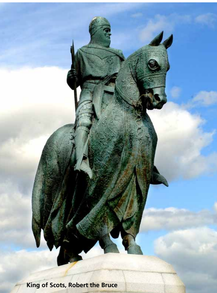
King of Scots, Robert the Bruce